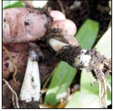
Wild Leeks, photo by Dave Wilsey to show leaves in the forest, and then the first to lose them as other plants begin to show.

There's no science behind this. but I think those first growths of wild edible greens transfer the energy of spring life from the forest to the forager. Fiddlehead ferns and wild leeks (ramps) are two rather accessible wild spring greens found in the area. Edible fern fiddleheads come from the Ostrich fern-other varieties are considered inedible-in its earliest stages of growth, while the frond is still coiled but just beginning to unroll. Wild leeks taste like a combination of onions and garlic and are one of the first ground plants