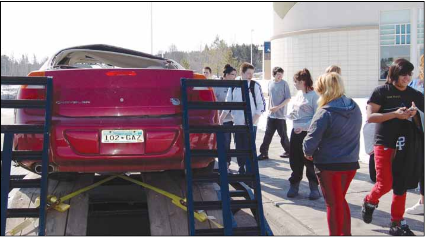
Students from the Ojibwe School look at the damaged car that was destroyed because a teenager texting and driving. She was also not wearing a seatbelt and was killed in the accident, read the whole story in the local section.