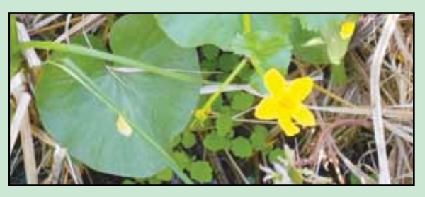
Marsh Marigolds

Keep your eyes out also for Marsh Marigolds. They are the beautiful yellow flowers you see flourishing in wet areas, including many of the wet ditches around Nahgahchiwanong (Fond du Lac). Marsh marigolds are one of the first wildflowers to bloom in the spring.