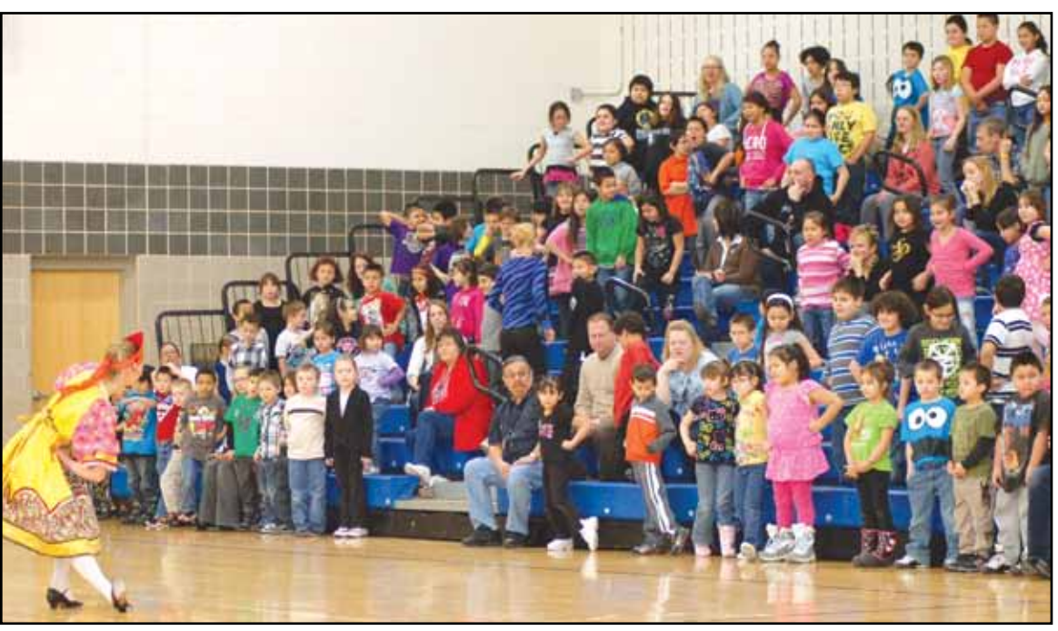
The students at the Ojibwe school learn a Russian dance.